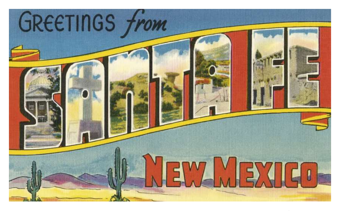
The pandemic has ravaged Santa Fe's tourism-based economy.

The so-called Zoom boom has brought remote workers seeking to stretch their dollar in relatively affordable places, while gaining proximity to nature and open spaces, to small and mid-sized cities across the mountain west. But they are often forcing locals out of their home towns entirely, at times exporting their former cities' housing crises on to these mountain towns.