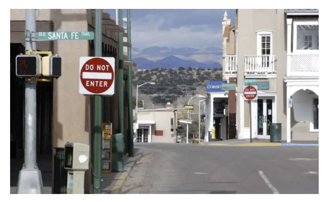
Santa Fe has seen an exodus of working-class residents.

In addition to people buying second homes and displacing locals, the mass conversion of houses and apartments into Airbnbs and other short-term rentals in recent years has likely been responsible for about 20% of Santa Fe's housing cost increases, according to a 2019 study from Homewise, a housing organization. That year, there were more than 1,400 short-term rentals in the city, a number that was growing by 50% a year.