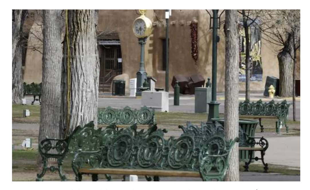
A central plaza and shopping district in Santa Fe.