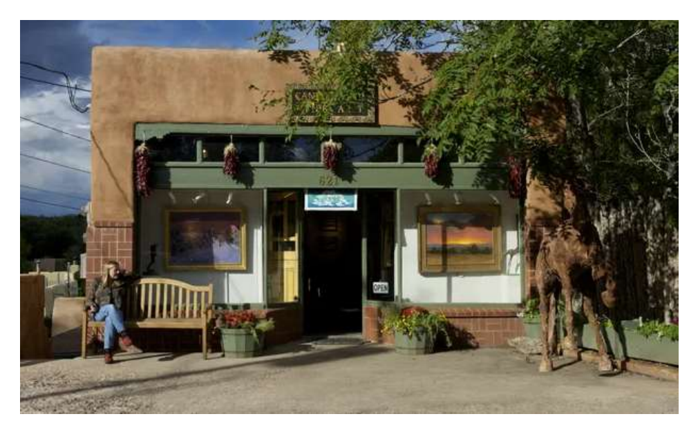
Canyon Road in Santa Fe, New Mexico.

The city committed about $2.5m to what wound up becoming a nearly $20m project.