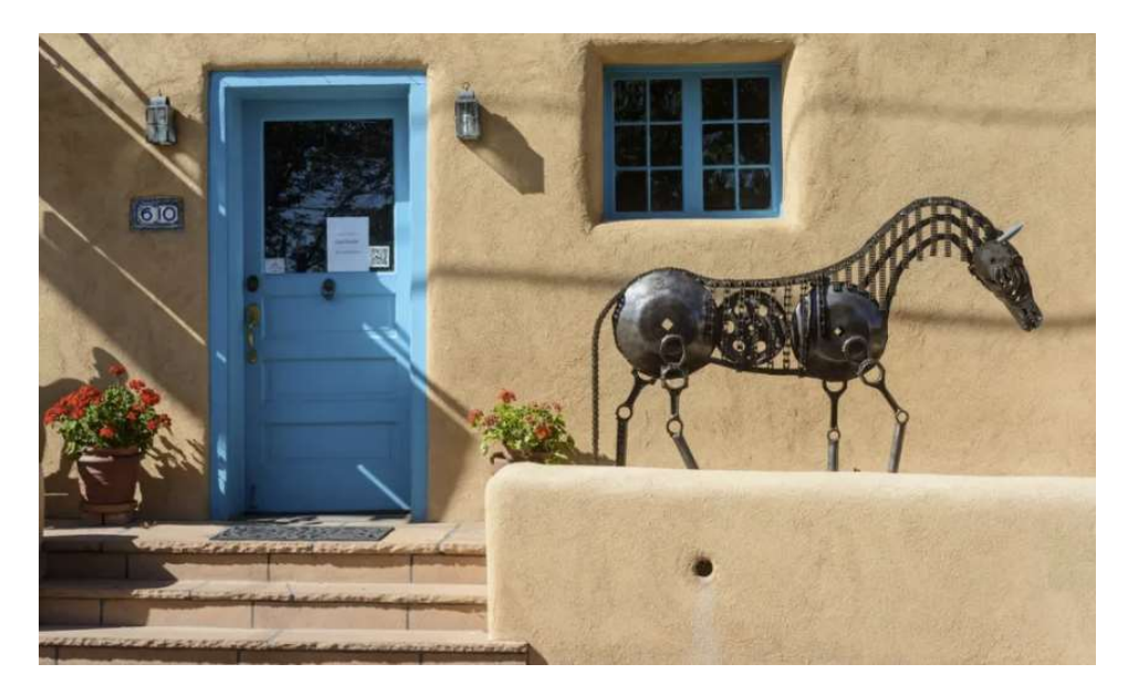
The Zoom boom has brought remote workers seeking to stretch their dollar in relatively affordable places such as Santa Fe.

The coalition also explicitly addresses tourism and second-home owners in its report. It suggests removing the state's 3% cap on property taxes for second homes as well as pulling some money made on short-term rental taxes and fees to the trust. Given that Airbnbs and the like have been a major contributor to Santa Fe's inflating housing costs, the report notes, such a funding mechanism would likely have broad support from the public.