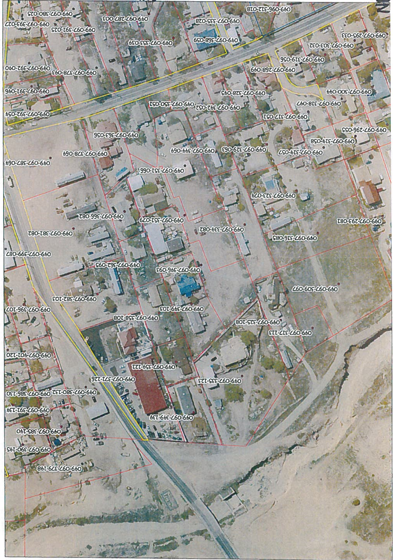
2008 Aerial Photography

THIS INFORMATION IS FOR REFERENCE ONLY. SANTA FE COUNTY ASSUMES NO LIABILITY FOR ERRORS ASSOCIATED WITH THE USE OF THIS DATA. USERS ARE SOLELY RESPONSIBLE FOR CONFIRMING DATA