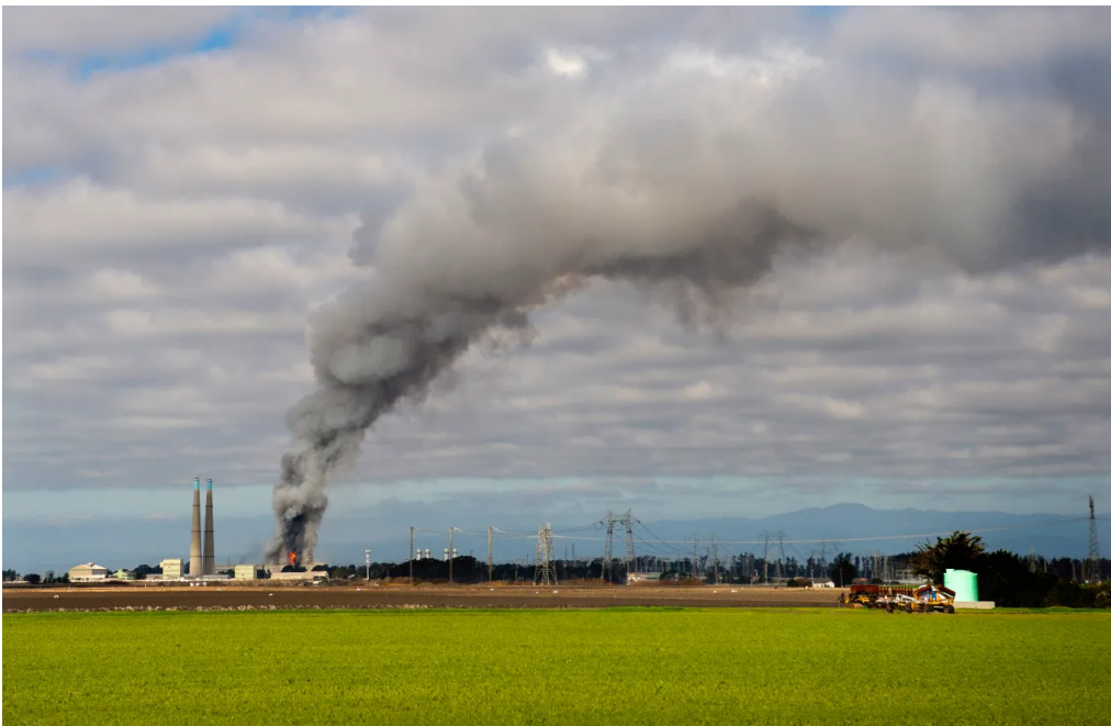
Smoke and flames are seen from Castroville as a fire at the Vistra battery storage plant burns in Moss Landing, Calif., on Friday, Jan. 17, 2025. Less than two weeks after the fire, scientists affiliated with San Jose State University discovered levels of toxic metals at more than 100 times the normal