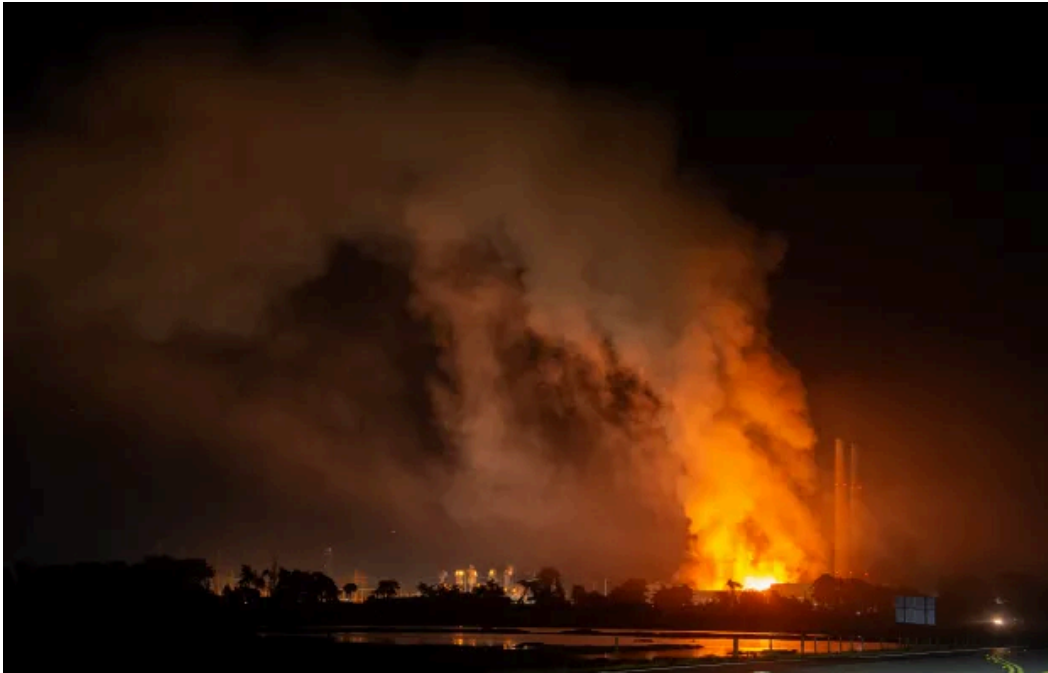
A fire rages out of control at the Vistra battery storage plant, one of the world's largest, in Moss Landing, Calif., on Thursday, Jan. 16, 2025.

"It's a major incident," he said. "All the resources in the county and our neighboring jurisdictions have been deployed to assist with this incident."