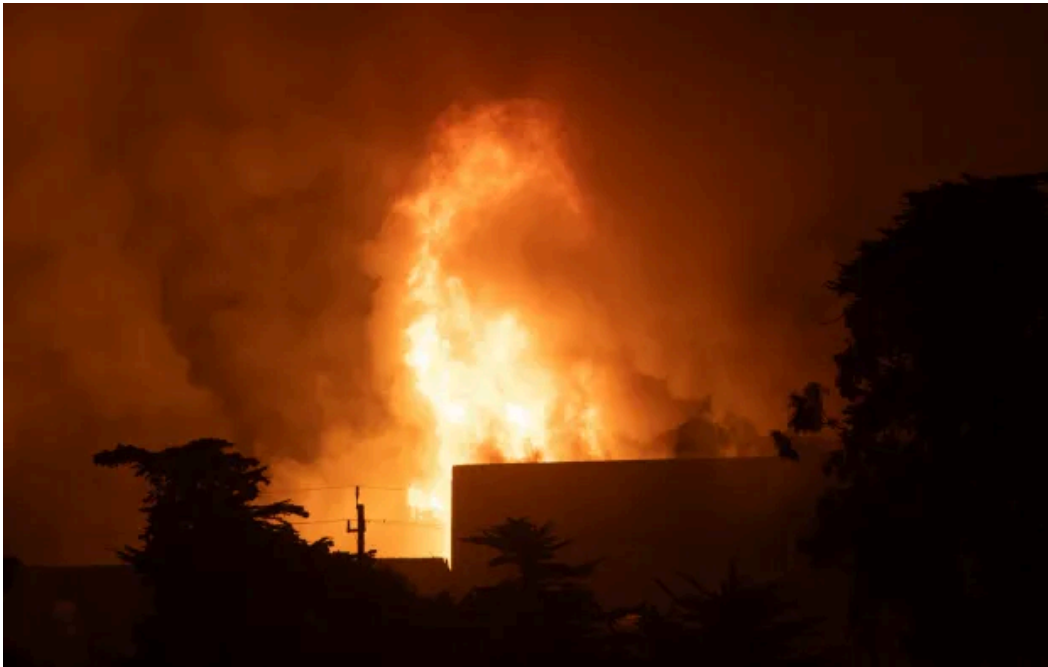
A fire rages out of control at the Vistra battery storage plant, one of the world's largest, in Moss Landing, Calif., on Thursday, Jan. 16, 2025.

The plant is located on the site of a now-shuttered 1950s-era PG&E Moss Landing natural gas plant visible for its huge smokestacks near Moss Landing Harbor. The first phase was completed in 2020, and it was expanded to 750 megawatts in 2023. Vistra sells the electricity stored there to PG&E, which also owns a separate 182-megawatt battery storage plant on the north side of the site that has 256 Tesla “Megapack” battery packs. That facility did not appear to be burning by 8 p.m.