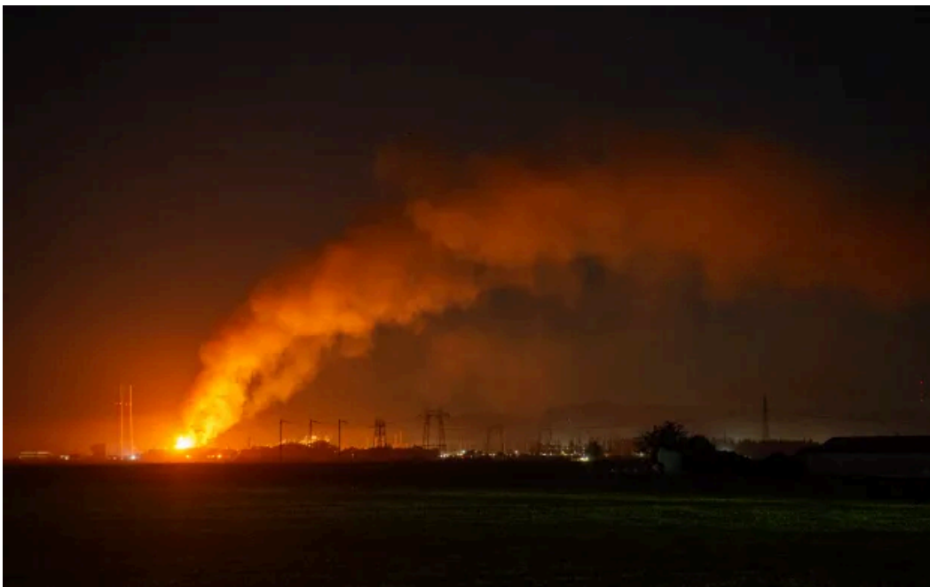
Smoke and flames are seen from Castroville as a fire at the Vistra battery storage plant burns in Moss Landing, Calif., on Thursday, Jan. 16, 2025.

Highway 1 is closed in both directions between Highway 183 and Struve Road. There is no estimated time to reopen the roadway.