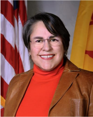
Camilla Bustamante Santa Fe County Commissioner District 3